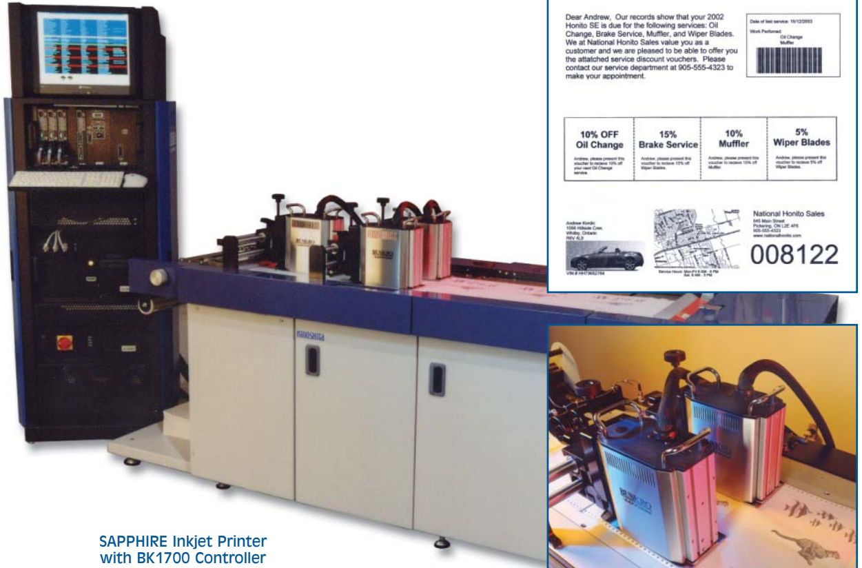
SAPPHIRE Inkjet Printer with BK1700 Controller

High Resolution. High Speed. High Impact!