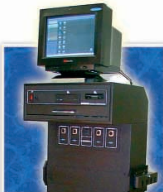
BK700 Controller with exclusive Buskro IQ Compose software. This portable print station can be used with Buskro and competitive bases.

Drives varying print technologies. Lets you upgrade or add system features down the road!